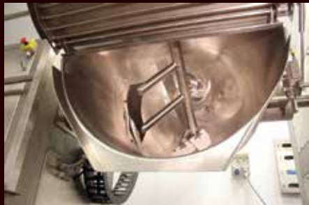
AdPro Mix Cold Food Processing Unit 50L to 1000L Capacity