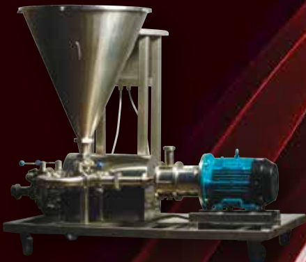
Powder/Liquid Mixers Up to 10,000Kg/Hr Capacity