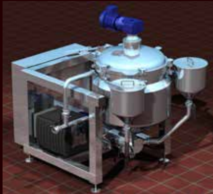
AdPro Vacuum Processing Mixer 50L to 6000L Capacity